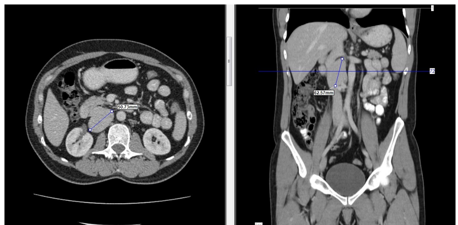
FIGURE 1. Vertical and sagittal section of computed tomography images

A male patient aged 36 years who was diagnosed with a mass in the left perirenal area was admitted to our hospital for further examination and treatment. His medical history included hypertension and coronary artery disease. He did not have significant diseases in his family history. On physical examination, no pathological finding was detected except for minimal tenderness in the left colic region. Laboratory findings were normal. On thoracoabdominal computed tomography (CT), a retrocaval, well-circumscribed, homogeneous mass lesion with a size of 60 × 50 mm compressing the vena cava (VC) at the left renal hilum level was observed, and no other pathology was detected in the scans (Figure 1). In clinical evaluation of the patient, soft tissue sarcomas, schwannoma, paraganglioma, retroperitoneal fibrosis, and CD were considered in the differential diagnosis owing to the absence of pathological findings other than isolated retroperitoneal mass. Owing to the mass proximity to the left renal vein and inferior VC inferior, a biopsy could not be taken for tissue diagnosis, and surgery was decided. Written informed consent was obtained from the patient, and elective surgery was planned. On exploration it was found that the mass was invad-