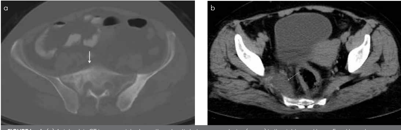
FIGURE I. a, b. (a) Axial pelvic CT image mainly shows the sclerotic heterogeneus lesion (arrow) in the right sacral bone. Focal hypodens areas are seen in the lesion. Sclerotic areas are also seen in the left iliac bone. (b) Axial pelvic CT image shows the soft tissue component of the lesion (arrow).