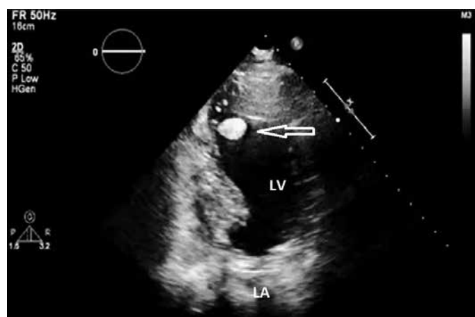
FIGURE 1. Thrombus image clinging to the left ventricle