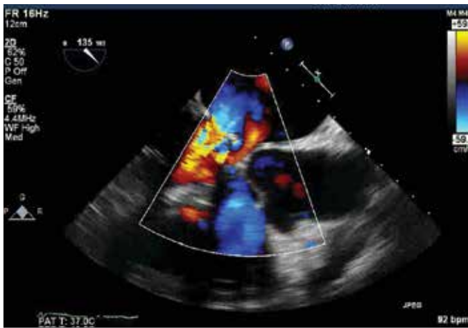
FIGURE 2. 3D transesophageal view of mitral valve perforation