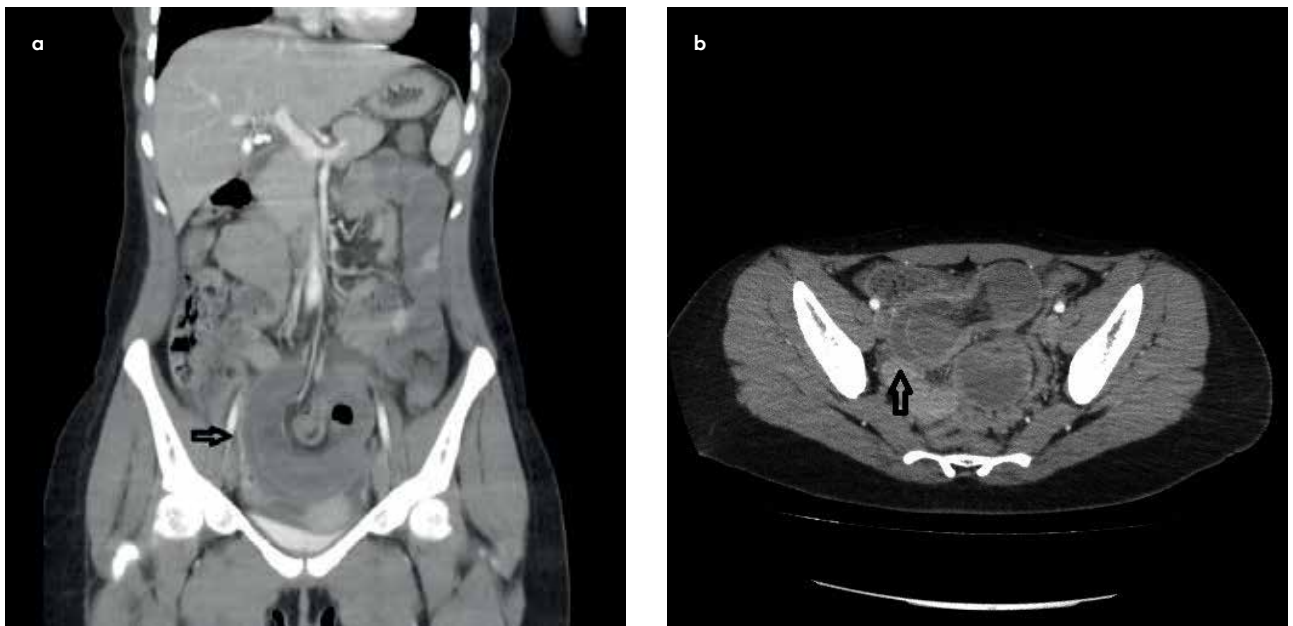
FIGURE 1. a, b. Arrow: Intussuscepted ileal loops in coronal (a) and axial (b) computed tomography images.

The patient was taken to operating room. Ischemic bowel loops were seen (Figure 2-3). The pathologic intestinal segment was removed, and the small bowel was anastomosed by a linear stapler. The postoperative duration was uneventful, and she was discharged five days after surgery. Pathological examination revealed a 45 centimeters-long intestine with intussusception without any luminal lesion. She had remained well during 22-month follow-up. Written informed consent was obtained from the patient who participated in this study.