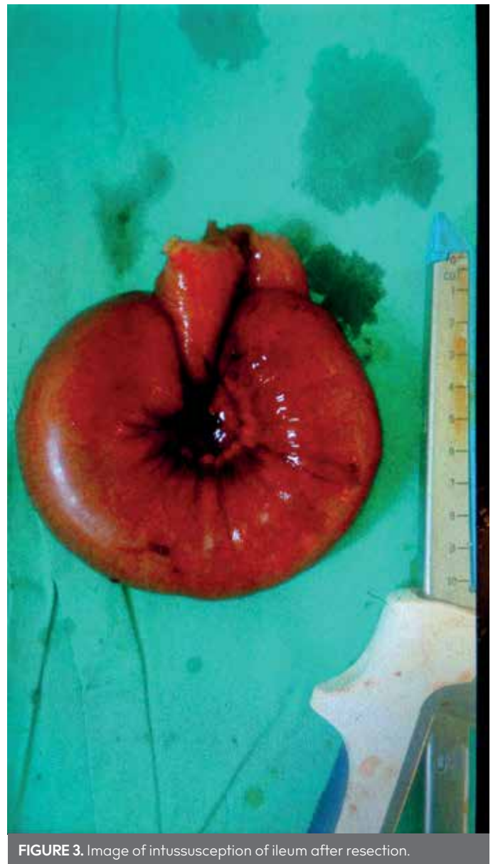
FIGURE 3. Image of intussusception of ileum after resection.

Preoperative diagnosis is difficult. Ultrasound is the preferred imaging method for pediatric intussusceptions, whereas it is not used for diagnoses in most adult cases due to bowel obstruction-related intestinal gas (2). Although approximately 50% of patients are diagnosed during surgery, CT has a diagnostic accuracy rate of up to 100% in adult intussusceptions (4).