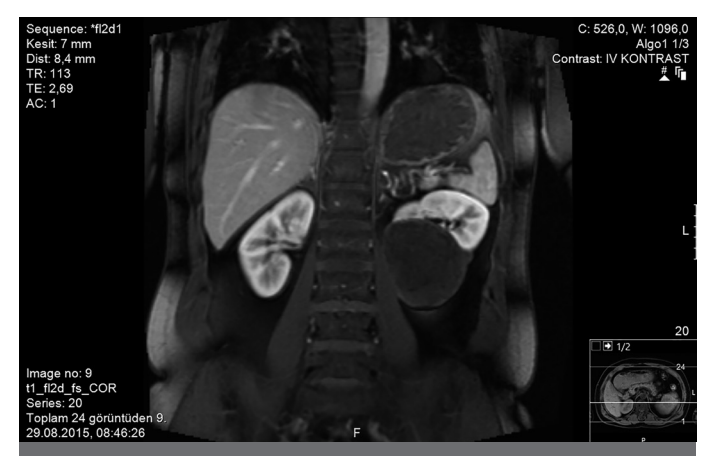
FIGURE I. MRI scan of the upper abdomen also revealed a 9\times7.5\times7 cm cortical–parapelvic localized lesion at the lower pole of the left kidney

Primary renal hydatid disease is very rare, mostly solitary, and unilateral. The initial phase of primary infection is always asymptomatic. Patients may remain asymptomatic for years (5).