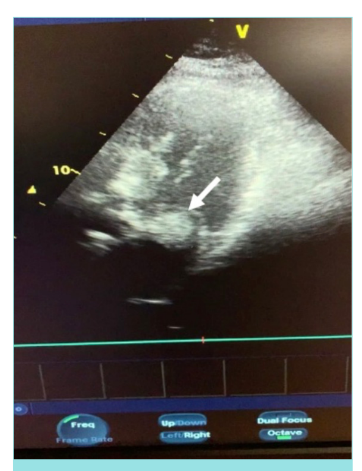
Figure 1. Doppler imaging findings

Risk factors of CPFs are unknown and diagnosis is reached en passant by echocardiography. Echocardiogram usually