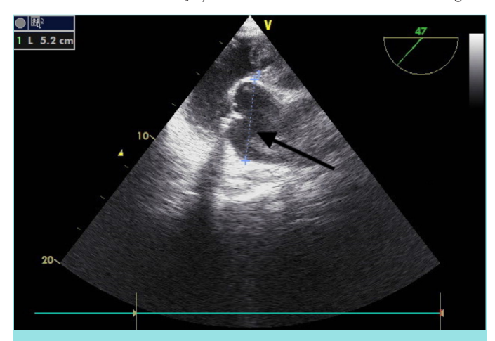
Figure 1. Preoperative aortic root measurements by transthoracic echocardiography and sinus valsalva was measured at 5.2 cm and is shown with an arrow.

Severe aortic regurgitation, ascending aorta aneurysm and dilatation of the aortic anulus led us to consider that valve sparing surgery would not be beneficial; therefore, the team decided to replace the root and the ascending aorta completely by performing the Bentall procedure. Both coronary buttons were prepared as usual and the aortic valve was excised. A 25 mm mechanical aortic valve (SJM™ Masters Series Mechanical Heart Valve SJM) was sutured to the 30 mm dacron graft