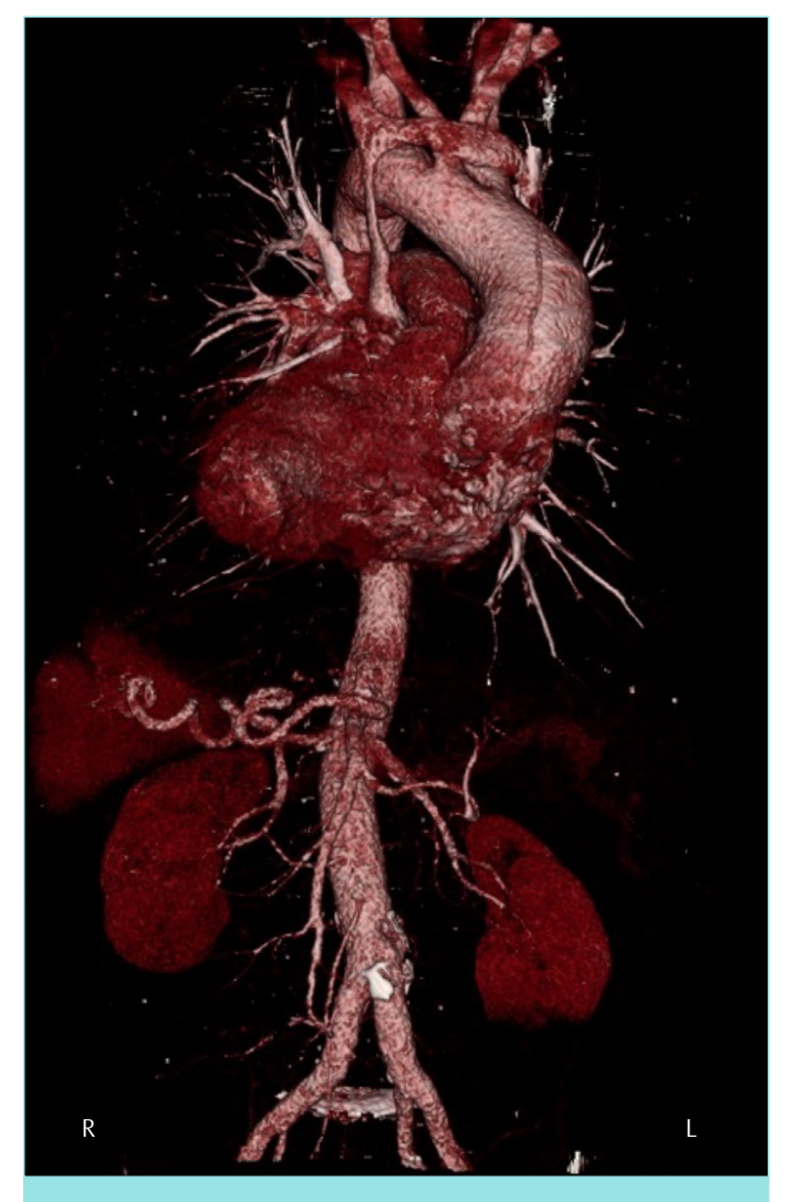
Figure 3. Preoperative CT scans showed reverse mirror images of all thoracoabdominal organs.

SIT is an autosomal recessive congenital anomaly characterized by opposite positioning of the thoracic and abdominal organs as mirror images. Dextrocardia with SIT is a very rare condition occurring in approximately 1–2 per 10,000 in the general population. Apart from the small percentage of SIT patients that have other congenital heart anomalies, such as transposition of the great vessels or heart defects, most affected adult patients live a normal lifespan and diagnosis takes place by chance when an X-ray or CT scan is performed for another reason.