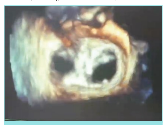
Figure 1. "Owl eye" appearance after MitraClip procedure, visualized with 3D transesophageal echocardiography.

Patients with severe mitral regurgitation and additional risk factors, including advanced age, COPD, prior CABG surgery, low EF, and high EuroSCOREs, face a significant risk of mortality and a diminished